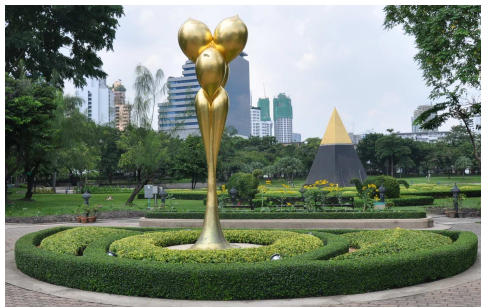
Fig. 5: Nonthiwat Chandhanaphalin, 1992. Growth, bronze, height 400 cm. Benchasiri park, Bangkok

Lowell et al. (2009) the aspect of content has subject matters which mediate goodness, love, unity, philosophy of life, human intention, beauty of nature, the way of life and local culture. It is the matter which everyone can perceive and understand, not the artist's personal matter; such as the sculpture title "Participation Development and Peace" shown the content to unite collaborate on the development of young people seeking peace and unity in the development of human peace and happiness. The sculpture was shown in Fig. 3.