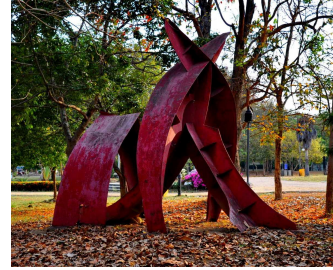
Fig. 2: Chanvit Yeamprapha, 1990. Red structure, iron, height 350 cm. Lanna King Rama IX park, Chiang Mai

Current conditions and problems of contemporary sculpture in the public park of thailand: Currently, 39 pieces of contemporary sculpture appear in the public parks of Bangkok. One piece of work in Lumpini Park disappeared.