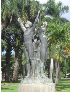
Fig. 3: Chakaphan Vilasinikol, 1985. Participation development and peace, bronze, height 250 cm. Lumpini park, Bangkok

The body of aesthetic knowledge of contemporary sculptures suitable for public parks in thailand: Aesthetics of contemporary sculptures in the public parks consists of 3 aspects.