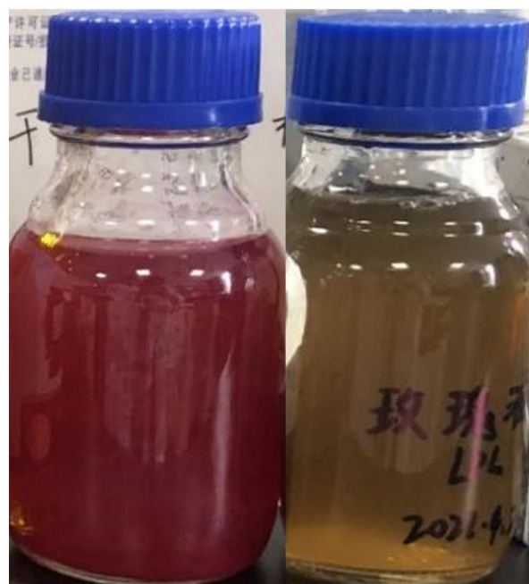
Fig. 2: Rose extract solution (left) and rose vinegar (right)

The determination results of protein, lipid, carbohydrate, sodium, and other essential nutrients and energy in the rose vinegar were summarized in Table 1. The main component of the rose vinegar was water. The contents of energy, carbohydrate, and sodium were 70.8 kJ/100 mL, 4.9 g/100 mL, and 17.8 mg/100 mL, respectively. Compared with other vinegar drinks, this rose vinegar was low in carbohydrates and energy, making it suitable for daily drinking.