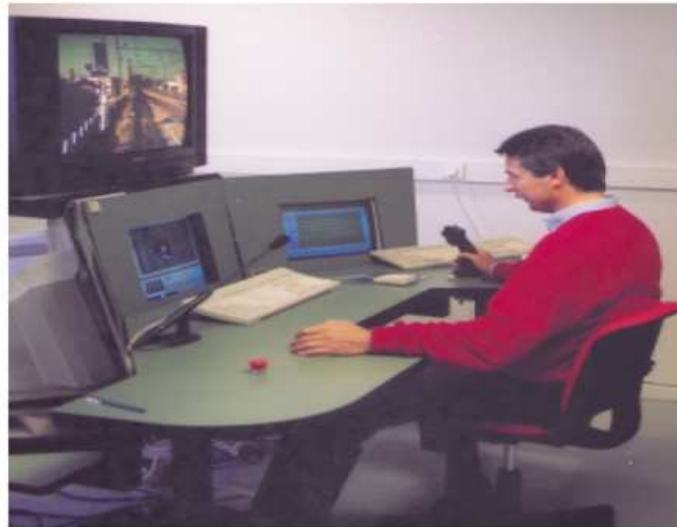
Fig. 1. Assessment system to study and validate the different HMI precepts retained

A privileged place was given to the drivers, thus leading to the definition of a concept of HMI linked to the regulation of speed, representing not the only solution, but the acceptable solution that we will study during the design phase that followed.