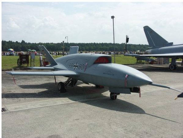
Fig. 11: A barracuda reconnaissance and combat UAV, manufacturer EADS