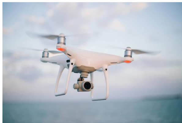
Fig. 6: A Quadcopter camera drone in flight