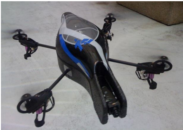
Fig. 7: The first prototype of Parrot AR.Drone