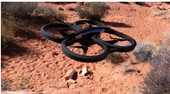
Fig. 8: Parrot AR. Drone 2.0 takes off, Nevada, 2012