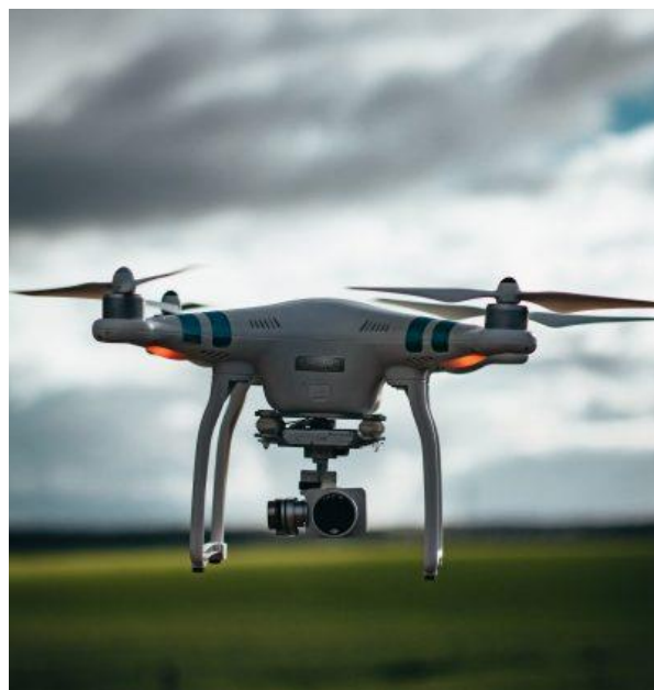
Fig. 5: A GPS drone is programmed to track the user

Curtiss-Wright VZ-7 was a VTOL aircraft designed by Curtiss-Wright for the US Army. The VZ-7 was controlled by changing the traction of each of the four propellers.