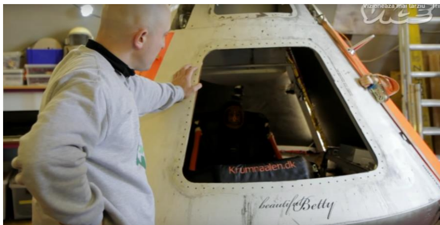
Fig. 2: Building a homemade spacecraft

"We managed to launch a space program with the help of everyone who contributed to it," said von Bengtson. "Many ideas come to us from people or by reading the wired blog. So I thought a Phase I could be created for this mission in Europe. Instead of receiving funds from people, we can receive ideas and solutions from different people in different fields (Richmond, 2013)".