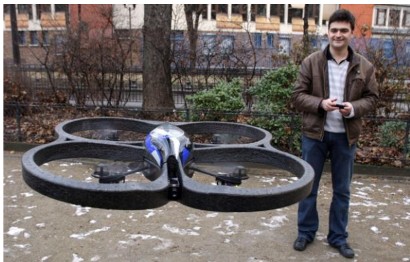
Fig. 3: Today there are many variants on the market, including small and cheap drones, which can be controlled using a smartphone

Drones will be increasingly difficult to calculate (count) and control.