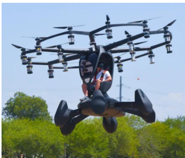
Fig. 12: The US military has successfully tested a single-person Hexa flying machine

The US Air Force has spent $ 25 million on the Agility Prime project this year.