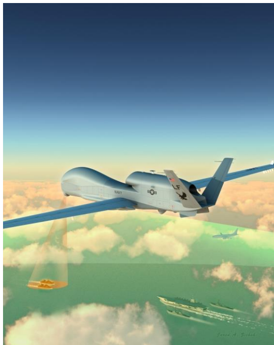
Fig. 4: A simple military spy drone

Unmanned aerial vehicles - or drones - are a fast-growing aviation sector with significant potential to create new jobs and growth in the European Union. That is why the EU has adopted a regulation aimed at the safe integration of remotely piloted drones into European airspace.