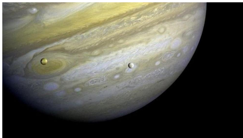
Fig. 1: Europa, one of Jupiter's moons. Europa is on the right, with another moon to its left and Jupiter in the background. The photo was taken by Voyager 1