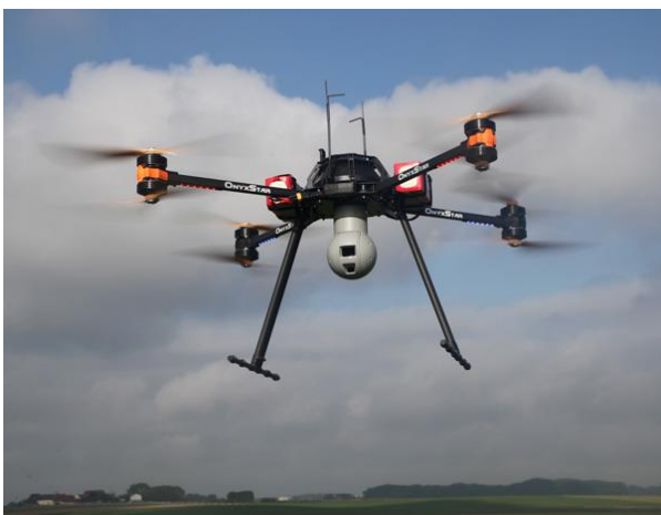
Fig. 9: A Quadcopter coaxial rotors - OnyxStar FOX-C8 XT Observer

Quadcopters have also been used in various art projects, but not limited to drone photography. At least one drone demonstrated the feasibility of painting graffiti on a spray-painted wall. They can be used in high-performance art with new degrees of positional control that allow new uses of puppets, characters, lights