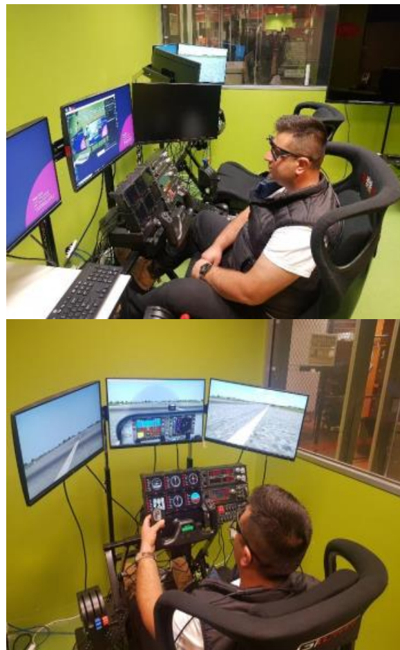
Fig. 2: Top – Calibration process and bottom – flight training using the simulator

There are different types of eye tracking devices; however, all the eye trackers can be categorized as either screen-based eye-trackers or eye tracking glasses. How the different types of eye trackers are employed in different fields of research differ. The difference between the two categories is that screen-based eye trackers employ a computer, which can be stationary or remote, while the glasses type, are head-mounted. In aviation, eye trackers are integrated with flight simulators in order to perform different flight scenarios. Figure 2 shows the implementation of an eye tracking into flight simulation.