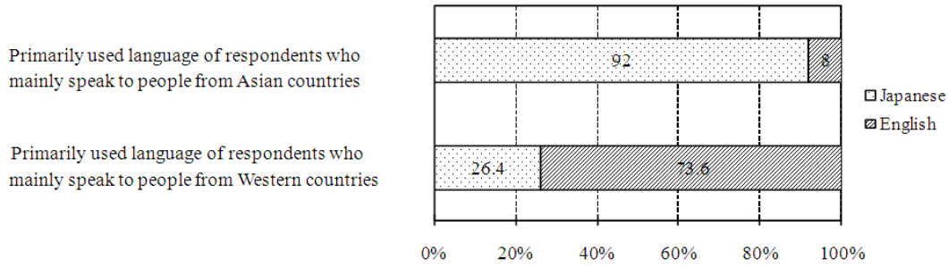
Fig. 1: Relation between origin of the foreigner and primarily used language