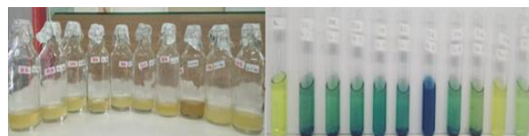
Fig. 3: The color of siderophores before and after added reagent (pictures of result research by Maimuna Nontji, 2021)