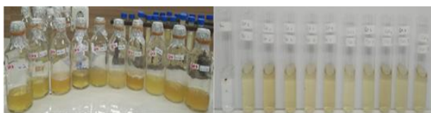
Fig. 2: The color of gibberellic acid before and after treatment (pictures of result research by Maimuna Nontji, 2021)

Several studies reported that siderophores produced by bacterial such as Azotobacter (16.22%), fluorescent Pseudomonas (11.11%), and Bacillus (10%) increased shoot and dry wheat biomass by 23 and 45%, respectively (Fischer et al. , 2007). This useful compound also playing important role in controlling plant pathogens.